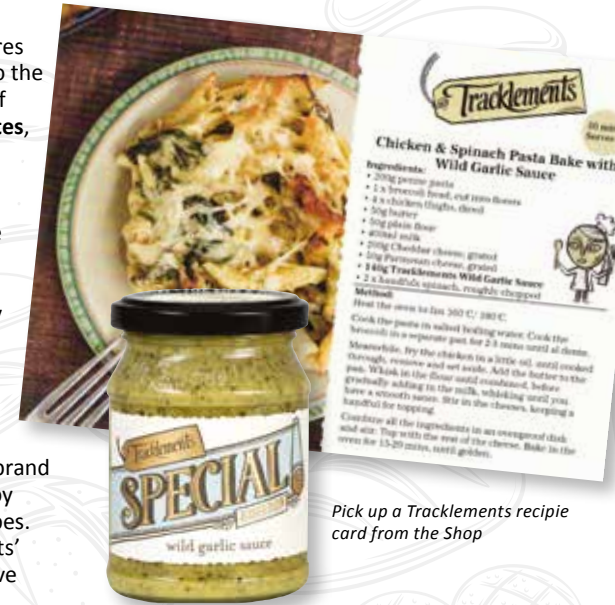
Pick up a Tracklements recipe card from the Shop

One of the highlights of our offerings is the Tracklements range, a socially responsible brand of artisan condiments and sauces. Crafted by hand in small batches using traditional recipes. Since the start of the company, Tracklements' products have been sold in Harrods and have