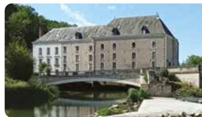
Front cover: Scene in Artannes by Jacques L'Hôte