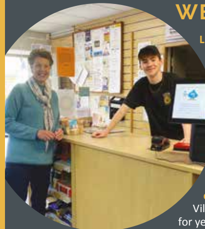
Two of our friendly volunteers

Pop into the Village Shop to find out how to join.