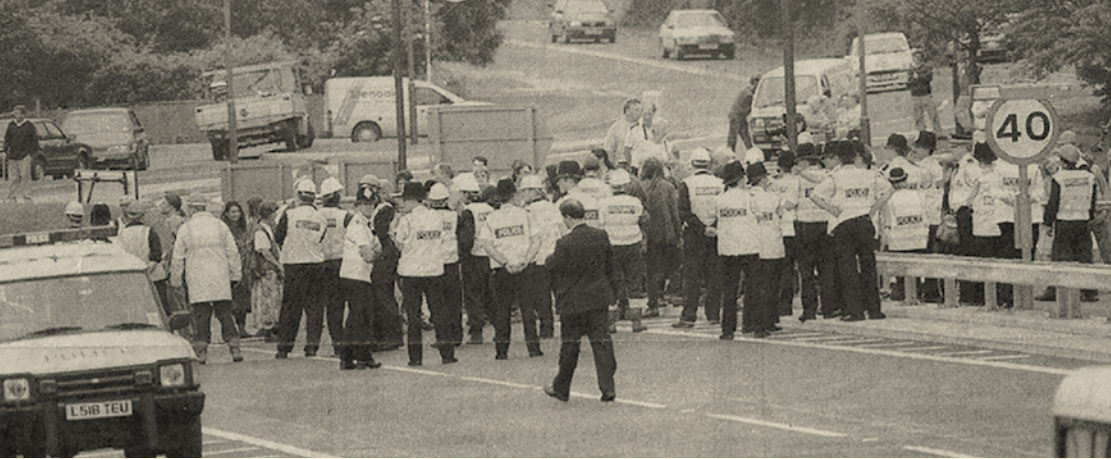
The bypass opened in 1966, the protestors return for one final act here at the Bathford end