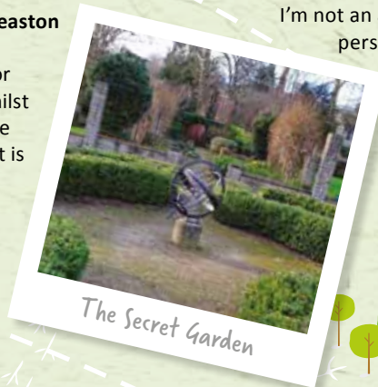
The Secret Garden

Next to the car park in Batheaston is a beautiful rose-adorned garden. Enclosed and safe for the kids to run around in, whilst you take a moment to admire the flowers. Our favourite bit is the wild planting area where there is a place to sit and eat, and a fun mud kitchen for the kids. There are no swings or slides but we remain enchanted enough to spend lots of time there.