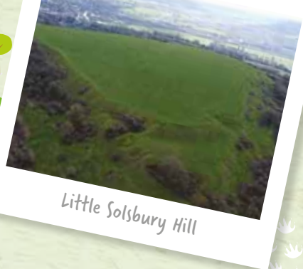
Little Solsbury Hill